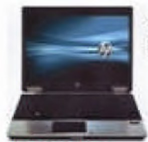
Hewlett-Packard Elitebook 2540p