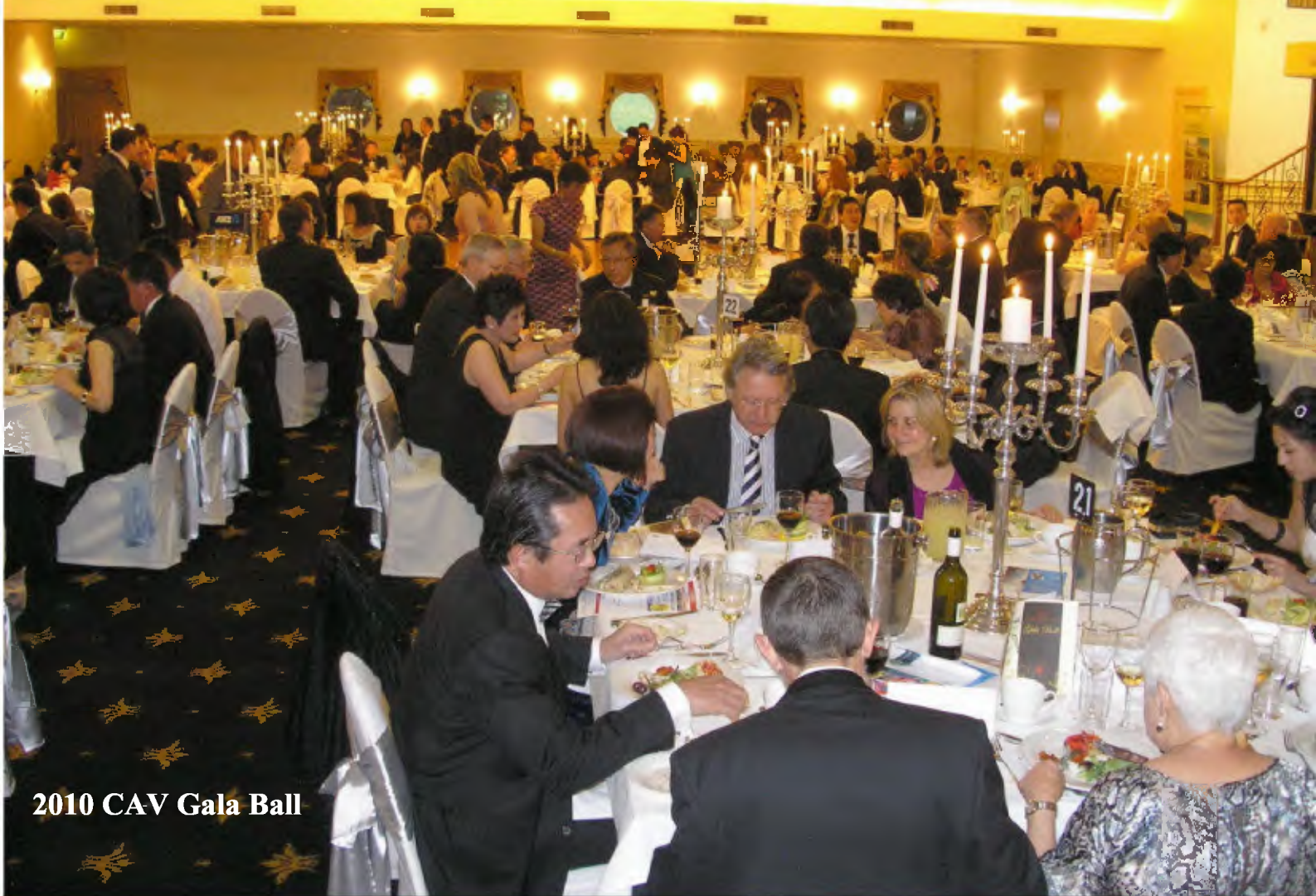
2010 CAV Gala Ball