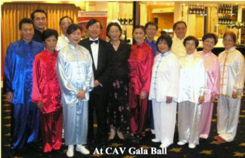
At CAV Gala Ball