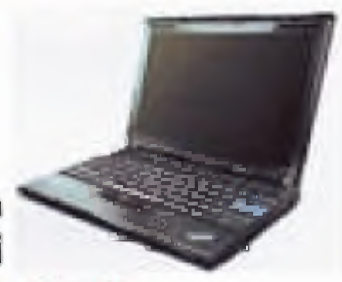
Lenovo ThinkPad T410i

Free Docking Station + Carry Case + Shipping